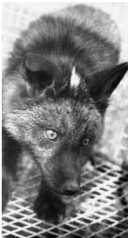
Figure 3. Piebald coat color is one of the most striking mutations among domestic animals. The pattern is seen frequently in dogs (border collie, top right ), pigs, horses and cows. Belyaev's hypothesis predicted that a similar mutation he called Star , seen occasionally in farmed foxes, would occur with increasing frequency in foxes selected for tamability. The photograph above shows a fox in the selected population with the Star mutation.

At seven or eight months, when the foxes reach sexual maturity, they are scored for tameness and assigned to one of three classes. The least domesticated foxes, those that flee from experimenters or bite when stroked or handled, are assigned to Class III. (Even Class III foxes are tamer than the calmest farm-bred foxes. Among other things, they allow themselves to be hand fed.) Foxes in Class II let themselves be petted and handled but show no emotionally friendly response to experimenters. Foxes in Class I are friendly toward experimenters, wag-